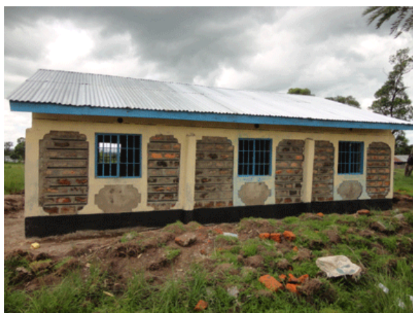
The new classroom for primary school Inkorienito, Transmara.