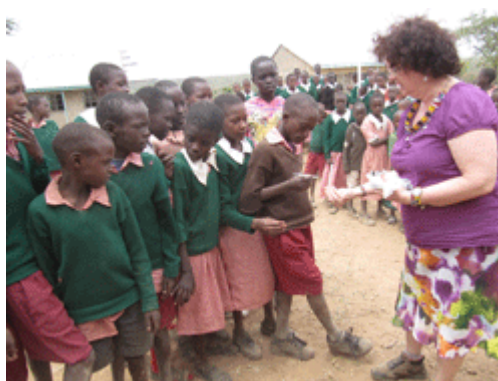
As well as in Enaramatishoreki primary and many others ...