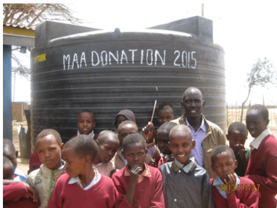
Oletukat school. Water tank