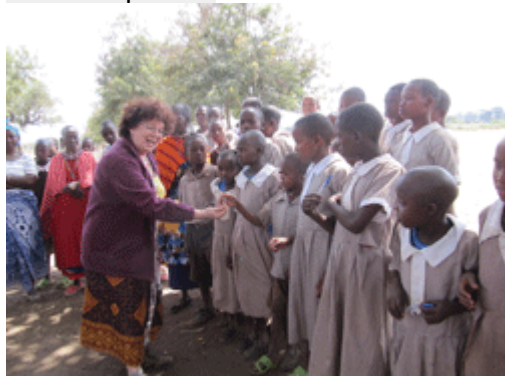
Pens distribution at Matepes primary school

We received and distributed in Kenyan schools this summer, offered school material (approximately 1000 pencils) by the leading Swiss company in manufacturing pencils of high quality and luxury pens CARAN D'ACHE (which means "pencil" in Russian language), as well as 200 pens offered by a Greek anonymous donor. This made lots of pupils very happy, especially the colour pencils, among the smallest, because it is an inconceivable luxury for 80 % of rural children in Kenya to use them. Here are some photos.