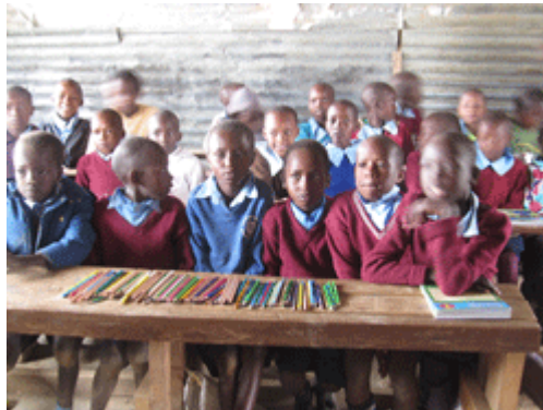
Crayons at Oletukat