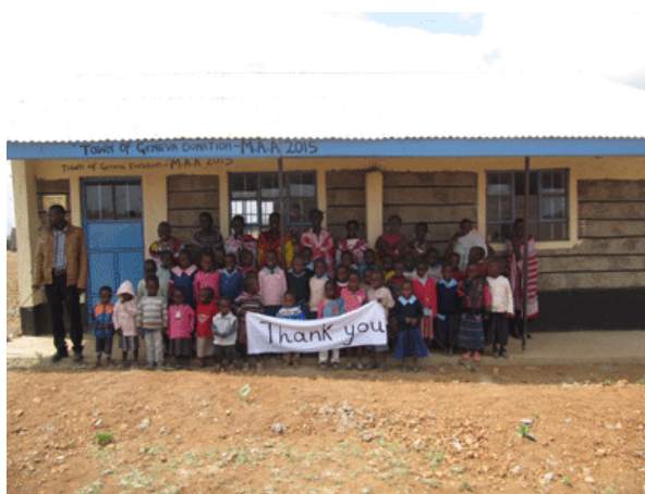
Emurua-Dikkir. Parents and children 3 to 5 years.